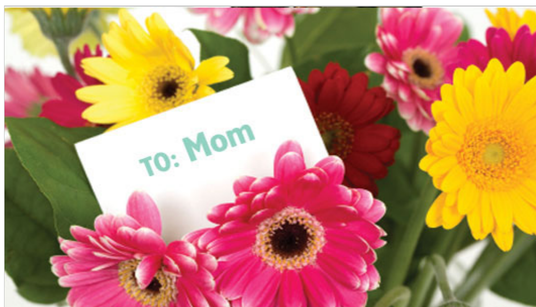
MOTHER'S DAY GIFTS: All moms will love getting these flowers.

Read more: FLORA , GARDENING , GREEN ALTERNATIVES , GREEN GIFTS , ORGANIC PRODUCTS