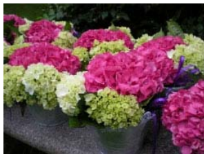
Petite French Bouquets in Galvanized Buckets

For a recent 'green' pool party, I made twelve small, lush and simple centerpieces with a recession-friendly budget. The centerpieces are also perfect for a birthday party, luncheon or small corporate event.