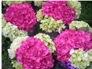
Pink and Mini Green Hydrangea

If you're planning an outdoor party this summer, petite-size whimsical centerpieces are fun, easy to create, and fairly inexpensive.