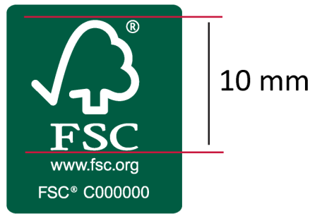
The mark of responsible forest management

Other considerations: You may wish to include supplementary text about FSC near the FSC promotional panel. FSC prefers the use of phrases such as ‘well-managed’ or ‘responsibly managed’ in place of ‘sustainable.’ Any supplementary text about FSC should be indicated when submitting the piece for approval.